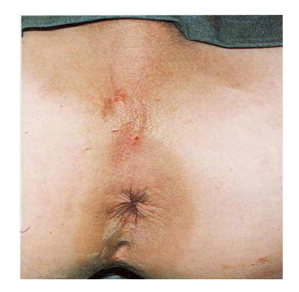
Fig. 5: Photocoagulation of the anal fistula completed