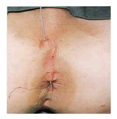
Fig. 2: Optical fiber threaded along fistula tract

The rear end of the probe was scratched for about half a centimeter to hold a silk suture of (oo) caliber tied on it. On pulling the probe out of the anal verge, the silk suture was threaded along the whole fistula tract. At this point the suture was untied and the probe removed from the operative field. The end of the silk suture emerging from the external fistula opening was tied very gently to the Orb tip of the optical fiber. By gentle steady pull on the silk end using the left hand, the right hand guided the optical fiber tip to negotiate the whole fistula tract (Fig. 2).