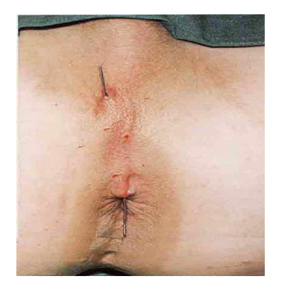
Fig. 1: Fistula tract completely probed

5W (a power density of 994 W/cm<sup>2</sup>). The procedure continued at this rate until the whole optical fiber was out of the fistula except for the Orb tip which was left for extra 10 seconds at the external opening prior to pulling it out terminating the procedure (Figs. 3, 4 and 5).